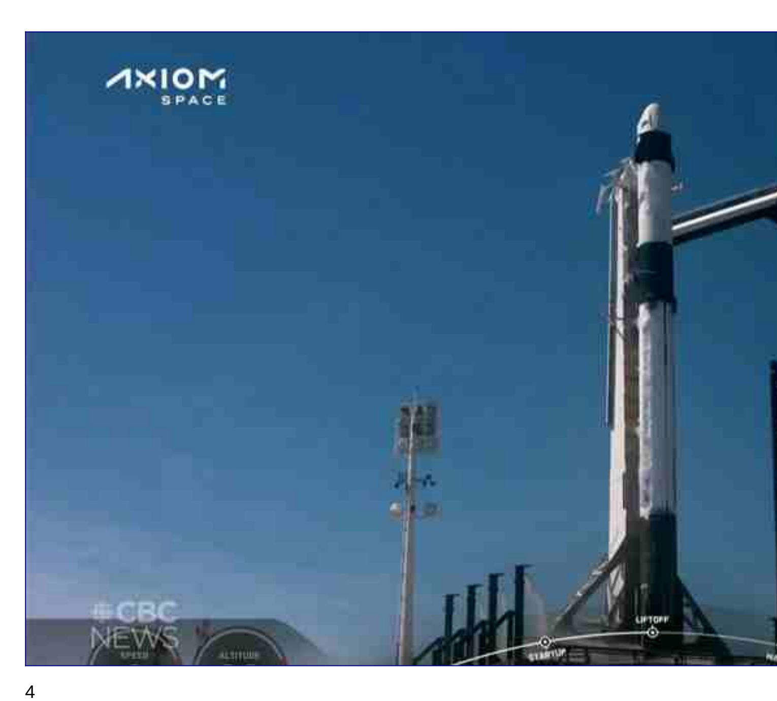
Experts have linked the debris to Elon Musk's SpaceX