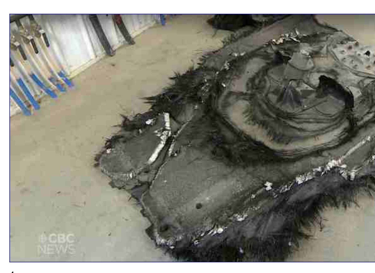
4 The charred chunk of fibre and metal is believed to have swooped from space